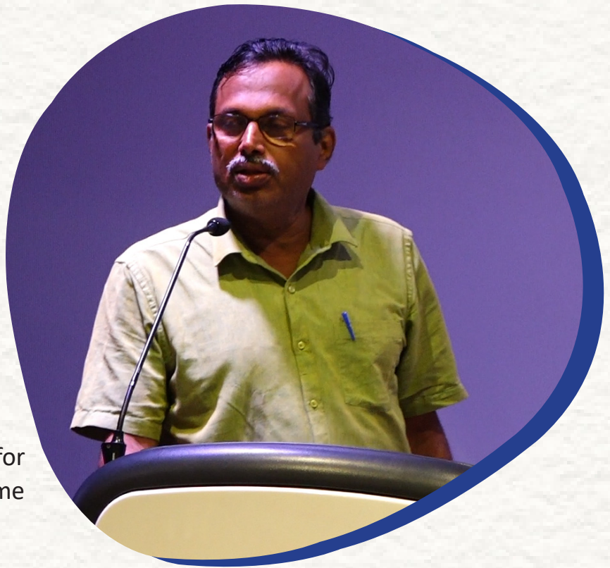
Sri Bipin Bihari Rath FA-cum-Special Secretary to Govt, DA & FE

The description of the subject matter of procurement to the extent practicable should be objective, functional, generic and measurable and specify technical, qualitative and performance characteristics and must not indicate a requirement for a particular trade mark, trade name or brand.